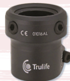
Clamp Adapter Model No. AAA225