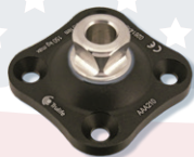
4-Hole Pyramid Adapter Model No. AAA210