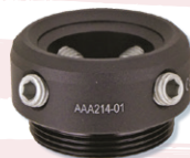
Rotatable Female Insert Model No. AAA214-01