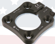
4-Hole Rotatable Flange Model No. AAA212